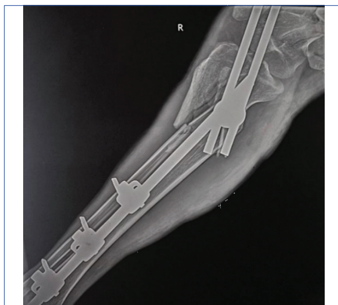
[Table/Fig-1]: Plain radiograph of the right tibia- anteroposterior and lateral view.

Curettage of the fracture sites was done and intraoperatively, it was discovered that the patient had a full-thickness quadriceps muscle loss. Correction of the deformity was achieved using the