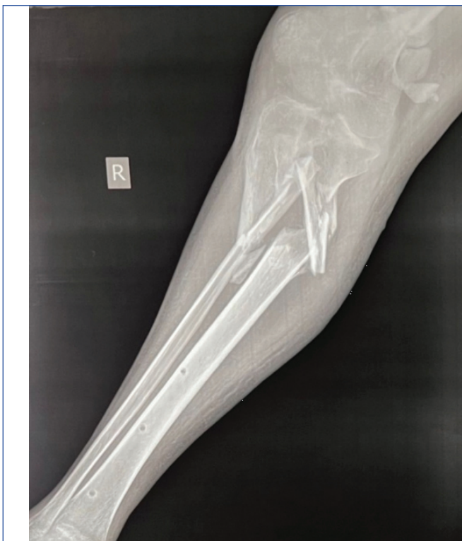
[Table/Fig-2]: Post removal radiograph with anteroposterior and lateral views keeping the complexities of the present case in mind the authors decided to go for the OSF system to achieve alignment of the knee to the original axis and correction of the limb shortening.